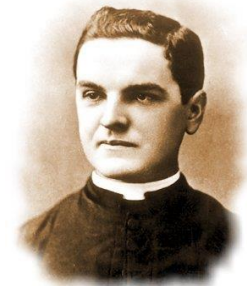
Venerable Father Michael J. McGivney

Born August 12 TH , 1852 Died August 14 TH , 1890 Founder of the Knights of Columbus